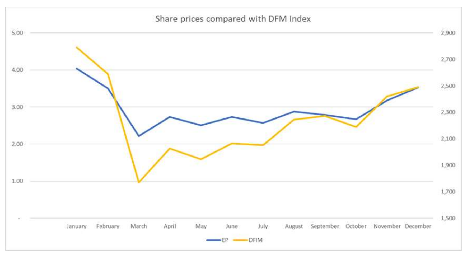
Annex F Comparative performance of the Company's shares with the market index and the sector index to which the Company belongs during 2020