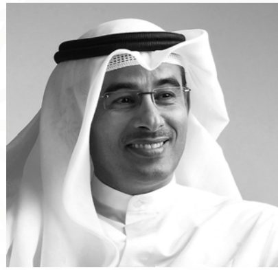
H.E. MOHAMED ALI RASHED ALABBAR Chairman

A global entrepreneur with active interests in high-value property development, retail, luxury hospitality, mining and commodities, Mohamed Alabbar is the founder and chairman of Emaar Properties PJSC.