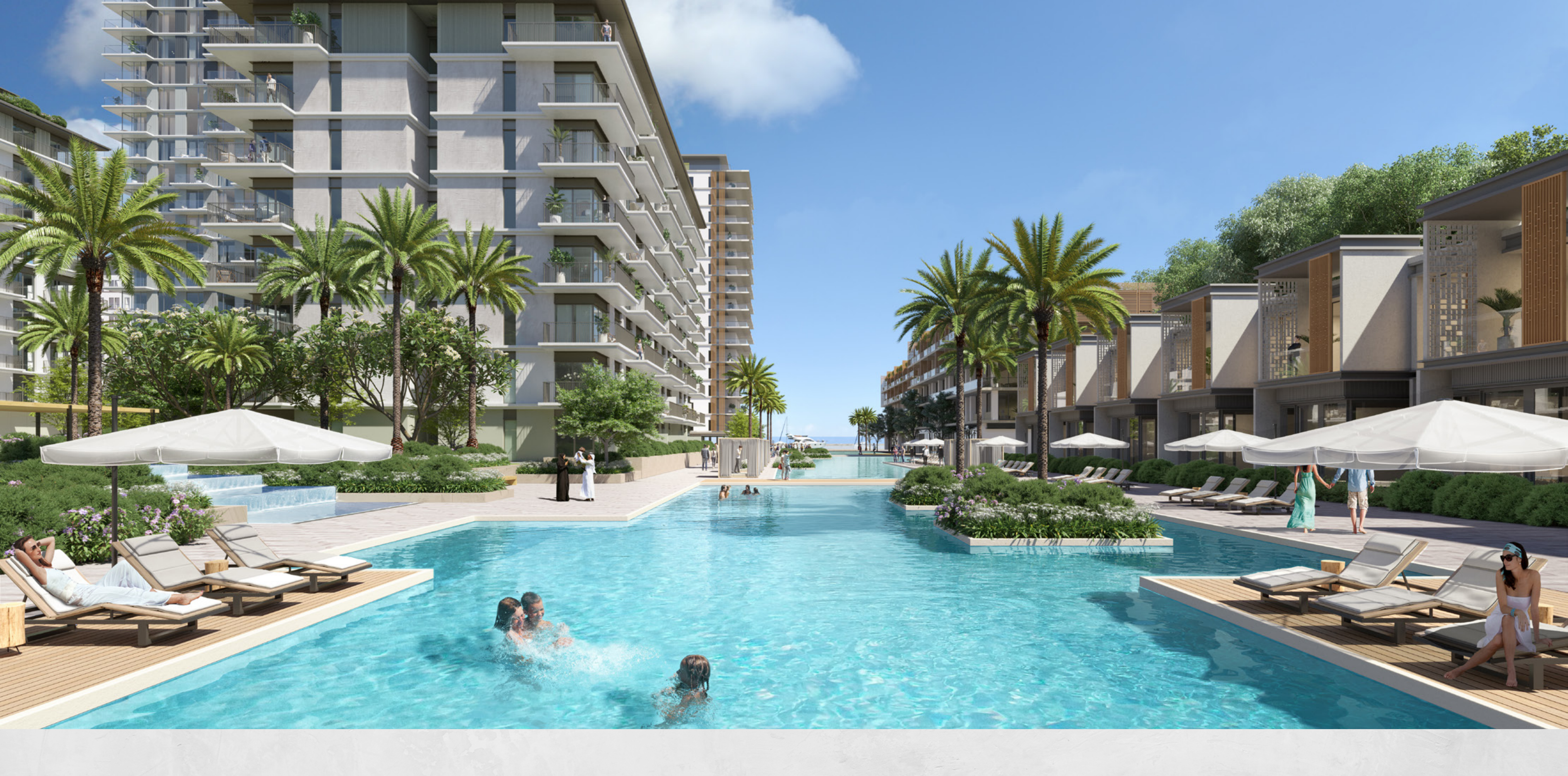
The Canal Pool